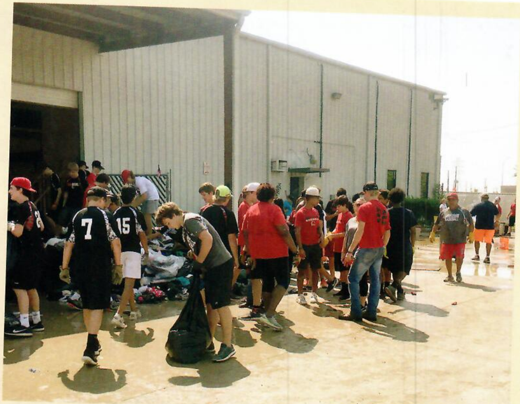
Hundreds of Volunteers Clean Out the Hope Chest

Mark your calendars now for October 20 and 21, 2017! You won't want to miss the chance to shop the Judy Dierker Holiday Market - a wonderful fall market featuring almost 120 vendors. Every year, on the third weekend in October, the Foundry Church at 8350 Jones Road hosts this major Cy-Hope fundraiser. Most of their vendors return year after year to showcase everything from clothing, artisan food items, home décor, yard art, jewelry, handcrafted specialty items, toys, candles, holiday decorations, and more. The market happens rain or shine, with indoor and outdoor shopping options – and shoppers enjoy free admission and parking.